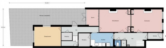
Archedestraat 72, 2517 RX Den Haag | Perceel (indicatief)