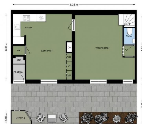
SUMATRASTRAAT 282 Perceel