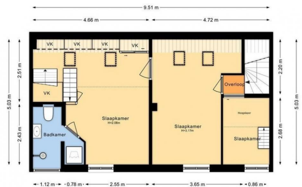
SUMATRASTRAAT 282 1e Verdieping Hoogte 3.17m